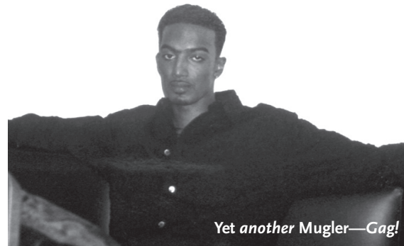
Yet another Mugler—Gag!